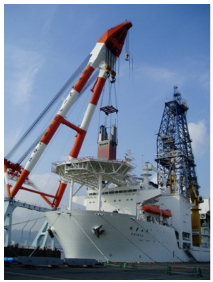
Pic.1 Installation of the Azimuth Thruster (approximately 250 tons), which gears were replaced, to the Chikyu through the opening of Helicopter Deck. Procedure was same for 4 Azimuth Thrusters. Other 2 at the stern had been installed at the Sasebo Shipyard.