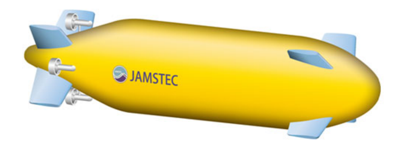
Image of the outward appearance of the new AUV (The actual colors may differ from this image)