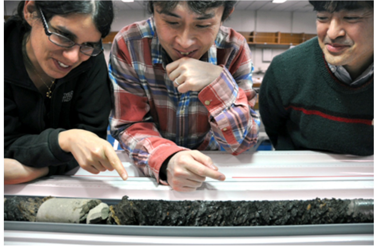
Figure 2: The core sample recovered from the Japan Trench fault zone