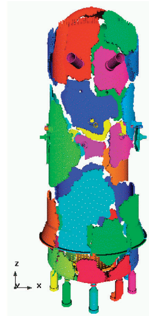
Fig. 2 Parts of ABWR model.

information on subdomain interfaces. In nonlinear analysis of solid, stresses and displacements are stored in the Parents as well. As a result, large-scale analysis data can be easily handled by increasing the number of Parents.