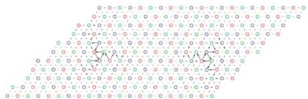
Fig.1 (a) Differential displacement map of 3-fold structure

There are essentially two factors to be considered in determining the core structure of a screw dislocation using the